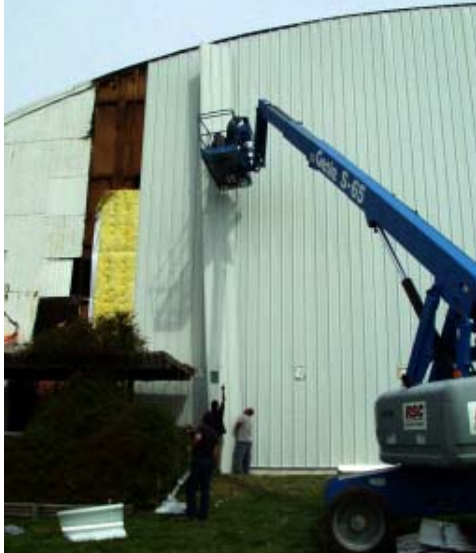
(Far left) Old sheathing is removed from the lean-to. (Center) Old sheathing and plasterboard gone and new insulation going up. (Left) It took a little effort to get a long piece of new sheathing in place. (Below) A new west end for 602.